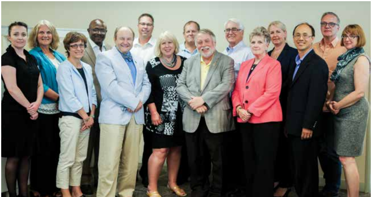
Group photo of the panel members, co-chairs and provincial staff.

The Panel wishes to acknowledge the work of the staff members from the Housing Policy Branch, Ministry of Municipal Affairs and Housing, and the Poverty Reduction Strategy Office, Treasury Board Secretariat, who contributed expertise, research, writing and other support to this process.